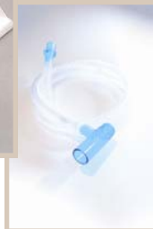
NeoPEEP™ Neonatal Resuscitation Circuits