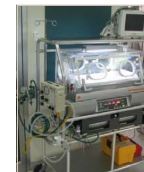
Ferno Custom Cart