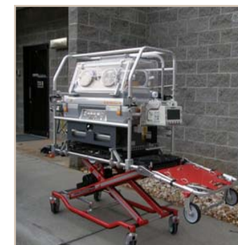
Ferno Powerflex Stretcher